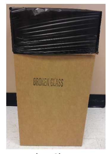
Broken Glass Box