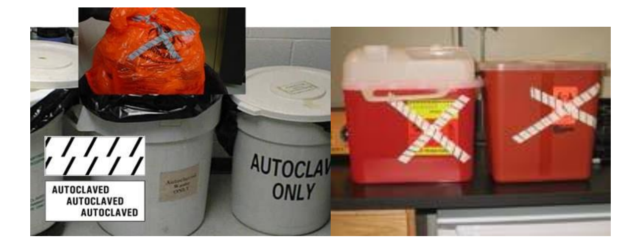
Figure 1 Autoclave tape utilizes a chemical reaction to indicate a temperature of greater than 121°C was achieved. This color change is usually displayed with hash marks or words that appear on the tape when proper temperature is reached.