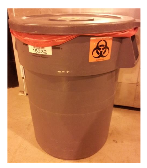
20 Gallon Waste Container

Due to the large size of serological pipets, investigators disposing of large numbers of these can request 20 gallon hard-sided biohazard waste containers (pictured below) from EHS through the SAM. These will be picked up by EHS staff, as for other biohazardous waste.