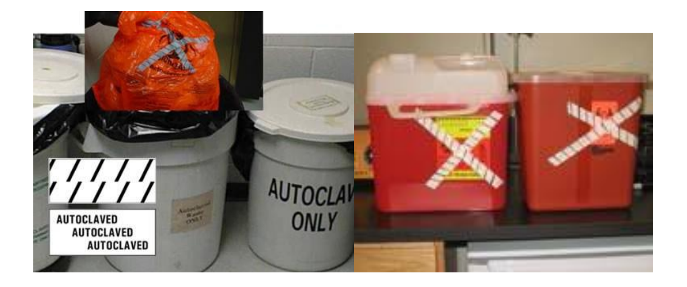
Figure 1 Autoclave tape utilizes a chemical reaction to indicate a temperature of greater than 121°C was achieved. This color change is usually displayed with hash marks or words that appear on the tape when proper temperature is reached.